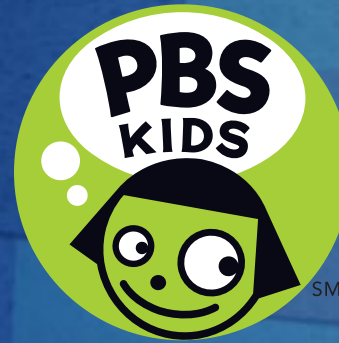
Circle graphic with Dot

* On air, the PBS KIDS logo may appear without the legal registration symbol.