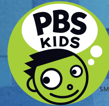
Circle graphic with Dash